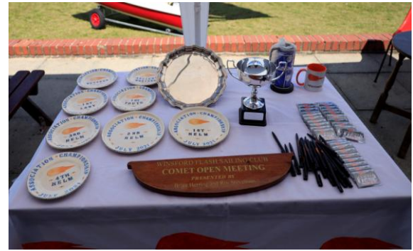
The very impressive display of trophies, awards and momentos presented to the winners and all of the entrants by the Comet Class Association